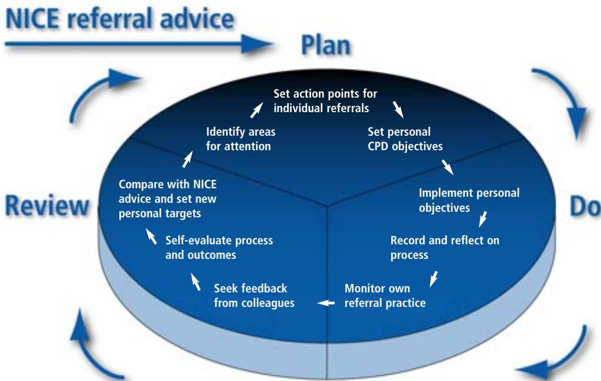
Figure 2 – A plan-do-review cycle for individual referral practice.