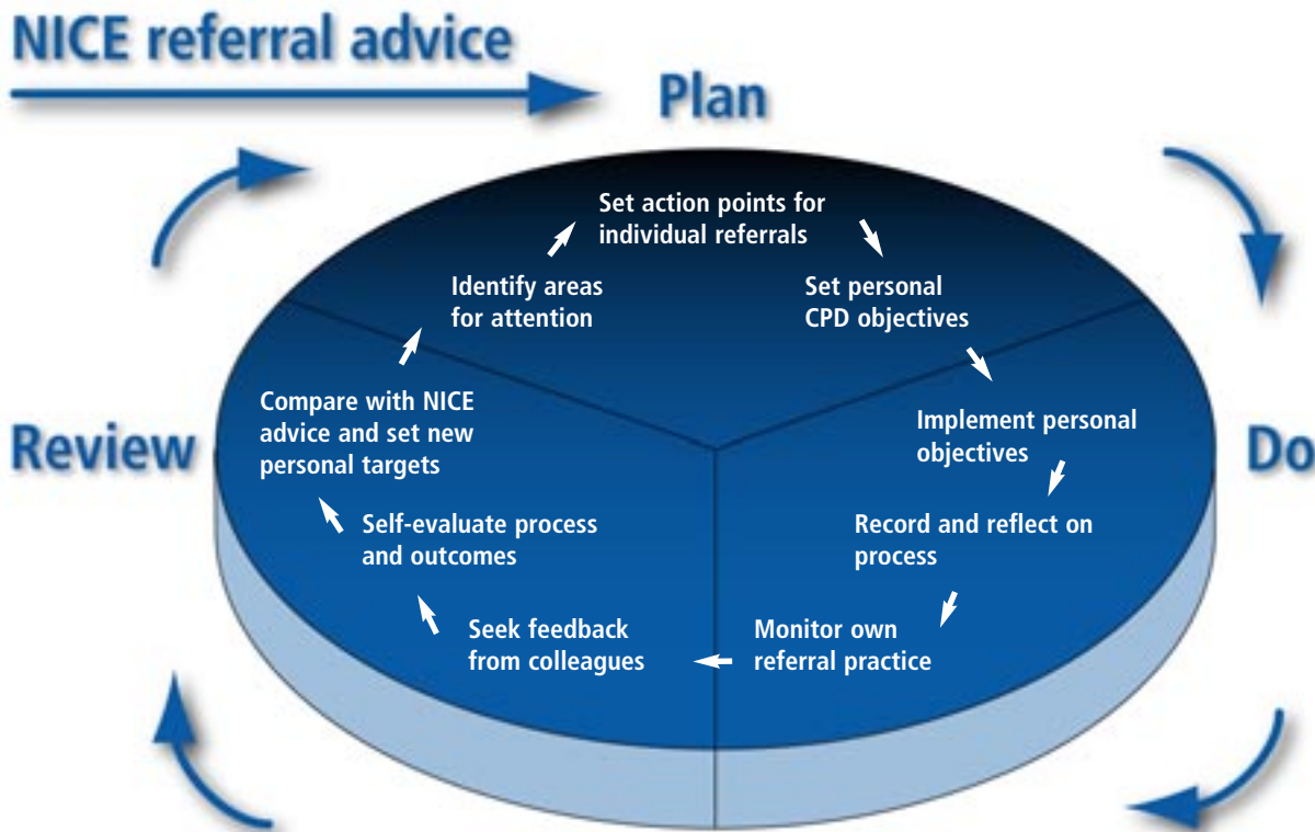
Figure 2 – A plan-do-review cycle for individual referral practice.